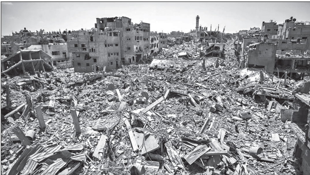
Shuja’iyya, Gaza City, July 2014. A retired American general described the Israeli bombardment as “absolutely disproportionate.”

deaths. 28 This does not mitigate Hamas’s violation of the rules of war by using these imprecise weapons for indiscriminate attacks on civilian areas. But the casualty toll tells a different story than the one that emerged from the near-total media focus on Hamas rocket fire. The coverage succeeded in obscuring the extreme disproportionality of this one-sided war: one of the most powerful armies on the planet used its full might against a besieged area of one hundred and forty square miles, which is among the world’s most heavily populated enclaves and whose people had no way to escape the rain of fire and steel.