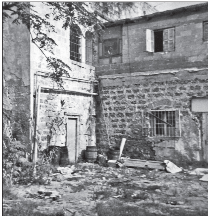
THE KHALIDI FAMILY

THE NAKBA REPRESENTED a watershed in the history of Palestine and the Middle East. It transformed most of Palestine from what it had been for well over a millennium—a majority Arab country—into a new state that had a substantial Jewish majority. 40 This transformation was the result of two processes: the systematic ethnic cleansing of the Arab-inhabited areas of the country seized during the war; and the theft of Palestinian land and property left behind by the refugees as well as much of that owned by those Arabs who remained in Israel. There would have been no other way to achieve a Jewish majority, the explicit aim of political Zionism from its inception. Nor would it have been possible to dominate the country without the seizures of land. In a third major and lasting impact of the Nakba, the victims, the hundreds of thousands of Palestinians driven from their homes, served to further destabilize Syria, Lebanon, and Jordan—poor, weak, recently independent countries—and the region for years thereafter.