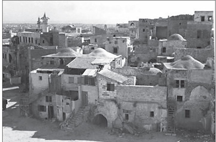
Jaffa in 1948, emptied during Plan Dalet

Scenes of flight unfolded in smaller towns and villages in many parts of the country. People fled as news spread of massacres like that on April 9, 1948, in the village of Dayr Yasin near Jerusalem, where one hundred residents, sixty-seven of them women, children, and old people, were slaughtered when the village was stormed by Irgun and Haganah assailants. 35 A day earlier, the strategic nearby village of al-Qastal had fallen to Zionist forces during a battle in which the Palestinian commander of the Jerusalem area, ‘Abd al-Qadir al-Husayni, died leading his fighters. 36 He too had just returned from a fruitless trip to an Arab capital, in this case Damascus, to beg for arms from an Arab League committee. ‘Abd al-Qadir was the most competent and respected of Palestinian military leaders (especially after so many had been killed, executed, or exiled by the British during the Great Revolt). His death was a crushing blow to the Palestinian effort to retain control of the approaches to Jerusalem, areas that were supposed to fall to the Arab state under the partition plan.