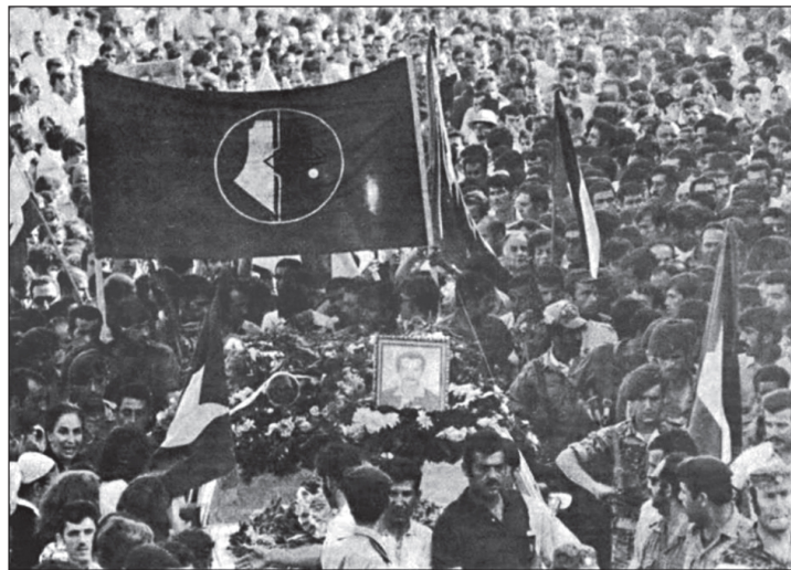
The funeral of Ghassan Kanafani, who was assassinated in a car bombing by the Mossad, Beirut, July 1972

Kanafani was also a prolific journalist, steeped in Palestinian resistance literature—indeed, he may have coined the term in a collection he published under that title 31 —and he had been deeply involved in politics since his late teens. Born in Acre in 1936, he and his family had been forced to flee their home during the Zionist offensive of May 1948, first settling in Damascus. When I met him in Beirut, he was thirty-three years old and the editor of al-Hadaf , the weekly magazine of the radical Popular Front for the Liberation of Palestine, of which Kanafani was also the public spokesman. He won others over not only with his literary talent, but also with his manifest intelligence, his self-deprecating and sardonic sense of humor, and his pleasant, open demeanor and ready smile. In light of his literary renown and militant activism, he was a significant figure in the revived Palestinian national movement. For the same reason, he was a target of the PFLP's enemies, the foremost being the Israeli government and its intelligence services.